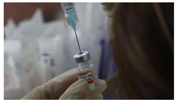
"77% of Philippines target population fully vaccinated"